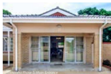
Masotsha Phase 5, Main Entrance