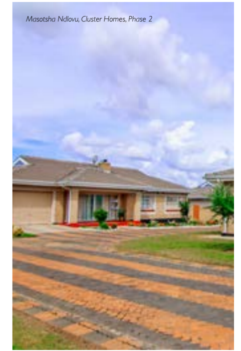
Masotsha Ndllovu, Cluster Homes, Phase 2