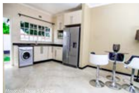
Masotsha Phase 5, Kitchen.

FBC BUILDING SOCIETY IS A MORTGAGE FINANCE INSTITUTION MANDATED TO MOBILIZE SAVINGS AND TO PROMOTE HOMEOWNERSHIP IN ZIMBABWE. THE BUILDING SOCIETY IS ALSO DIRECTLY INVOLVED IN RESIDENTIAL PROPERTY DEVELOPMENT FOR LOW, MEDIUM AND HIGH INCOME MARKET GROUP SEGMENTS.