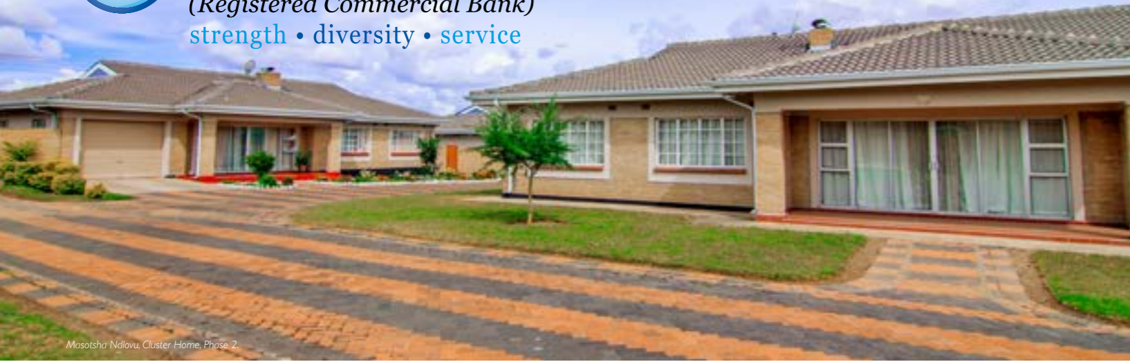
Masotsha Ndllovu, Cluster Home, Phase 2