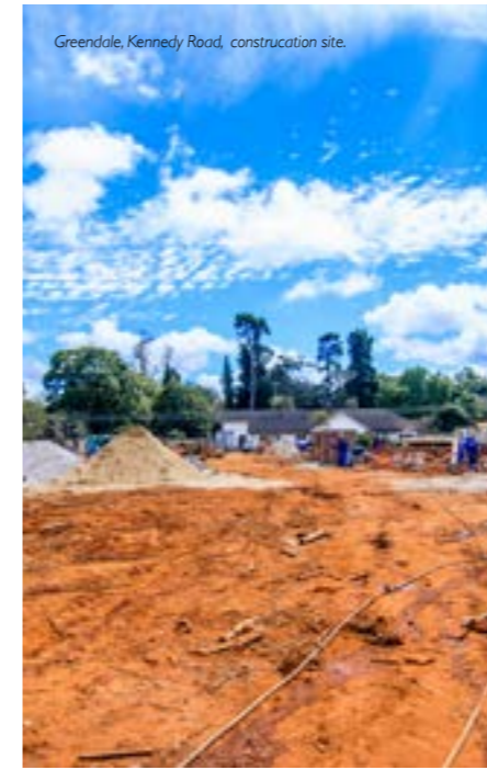
Greendale, Kennedy Road, construction site.