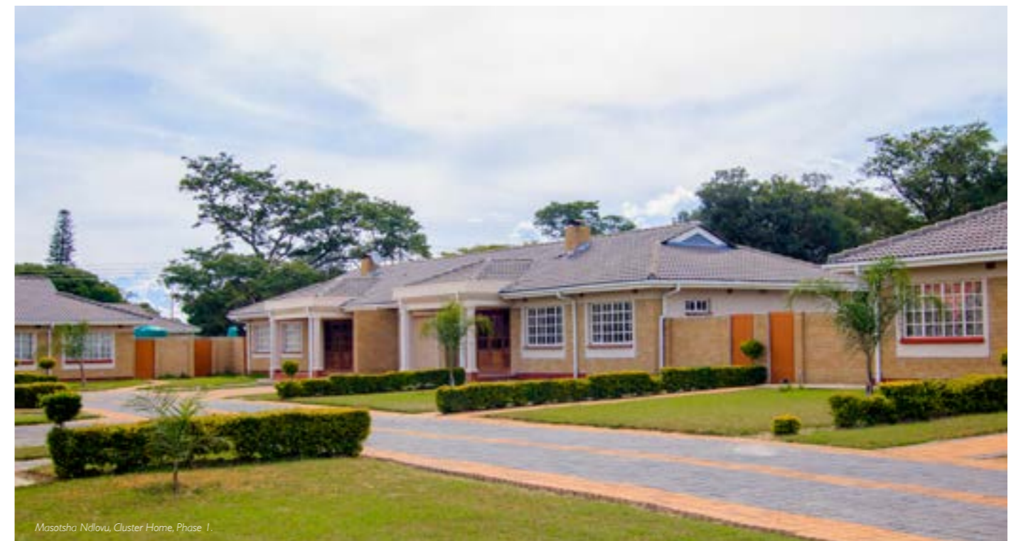
Masotsha Ndllovu, Cluster Home, Phase 1.